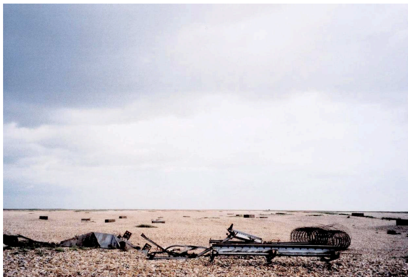
FIGURE 3 Metal and concrete blocks strewn on the shingle.

The trail takes you to the Bomb Ballistics Building, and inside you are invited to sit on the very stool, looking out through the same window, from where the flight-paths of dropping bombs used to be recorded. On the open top of the building, you are drawn towards a telescope from the testing days, and as you peer through it the cross-hair slides uninterested over Orford's medieval castle, the mainland's green pastures, the quay's quaint boats; it seems only to hook onto ghost-planes and ghost-bombs passing in and out of sight. Peeling yourself away, you survey the panorama below you as the Trust suggests, and the site-in-use recedes from view.