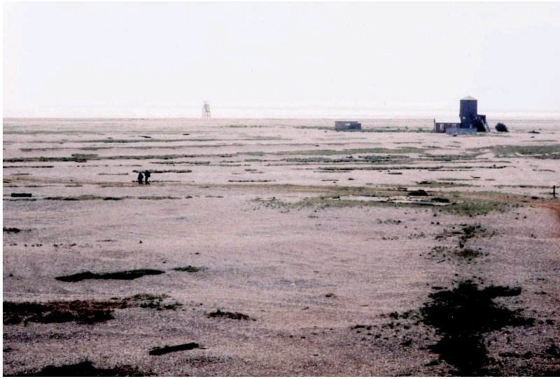
FIGURE 4 Black Beacon (right) and Police Tower (left), from on top of the Bomb Ballistics Building.

outside, you welcome the clarity of the drawings, the height of the building and the distance they offer from that overwhelming landscape. With a tinge of self-satisfaction, you feel it is you who has reasserted order over your view.