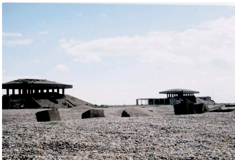
FIGURE 5 Laboratories 4 and 5, named by locals 'the Pagodas'.

On the boat journey back to where your car is waiting, there is much you could think about what you have seen here. You know this place has been described as a monument to