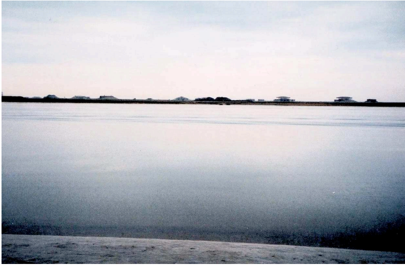
FIGURE 2 Looking across the river to the AWRE site on Orford Ness. i

changes rapidly here. Before being released from the volunteers' stewardship on the other side, you are briefed on the natural and military historical attractions that the Trust's trail will lead you past, and you are told that, for reasons of nature conservation and unexploded ordnance, this trail must not be left.