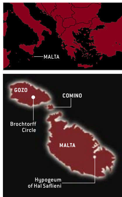
ISLANDS OF MALTA are dotted with numerous groups of large stone temples. One noteworthy burial site, the hypogeum of Hal Saflieni (right), was discovered in the early part of the 20th century. The authors are studying another burial site within the Brochtorff Circle.

Today the dry, rocky, hilly islands of Malta seem inhospitable to farming communities. Little soil or vegetation is present, and obtaining fresh water is a problem. Yet the geological evidence suggests that between 5,000 and 7,000 years ago, a far more inviting scene greeted the early inhabitants. Those people probably cleared the fragile landscape of its natural vegetation fairly rapidly. Thereafter, severe soil erosion gradually robbed the islands of their productivity. The resulting environmental fragility may have caused agricultural yields to be unpredictable. That stress may well have shaped the strange and often extreme society that