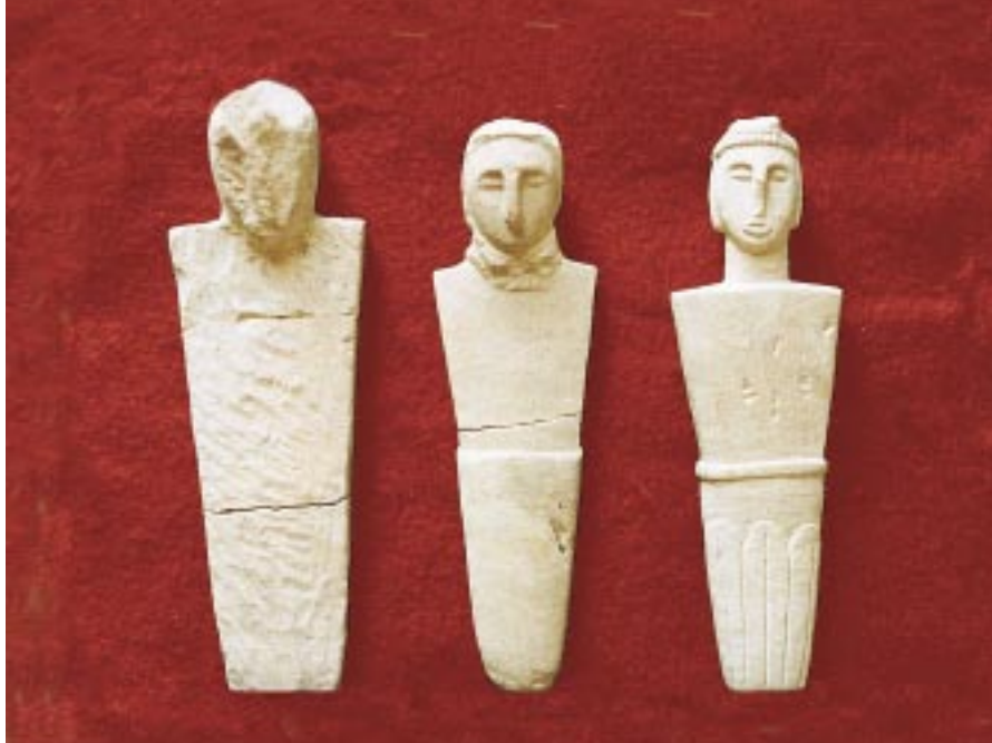
SMALL STONE IDOLS were probably used by priests or other specialists in burial rituals at the Brochtorff Circle during the Tarxien period. The three at the top representing human figures show very different levels of detail and artistic execution. The other three, which invoke animal and phallic imagery ( bottom ), are more fanciful and individualized.