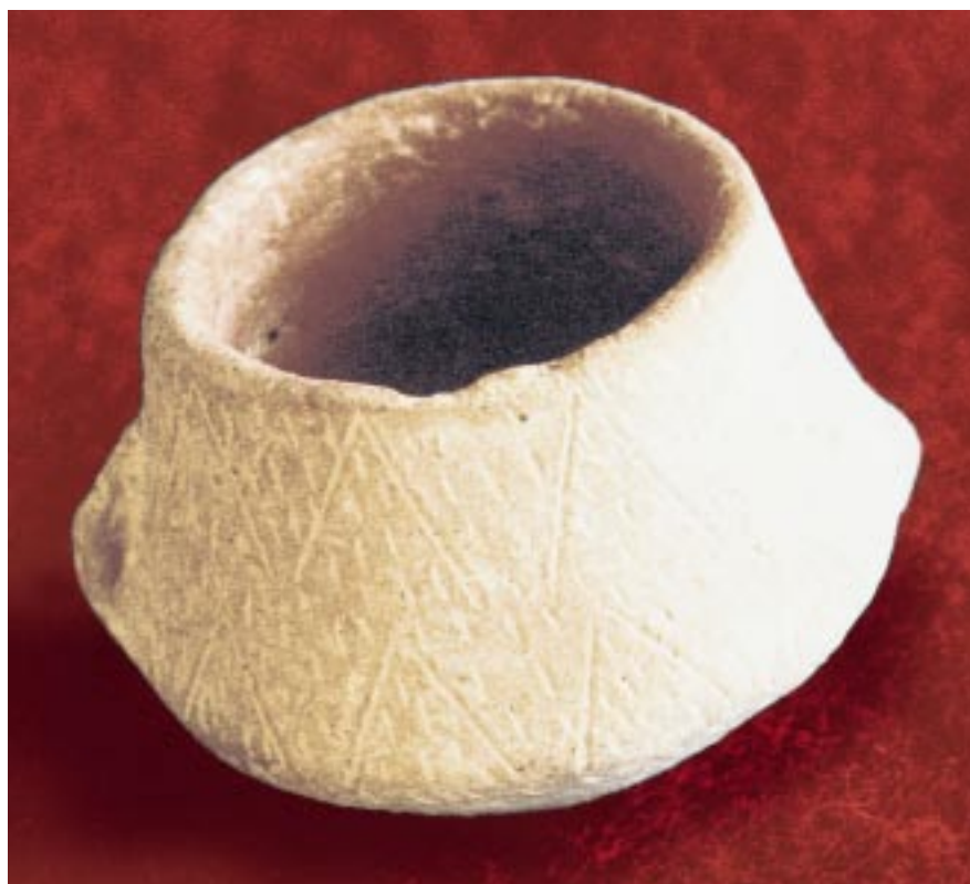
SMALL CERAMIC POT was used to hold red ocher, a pigment daubed on ritual figures and human bones during Maltese burial rites.

gant, and there is evidence that some of it included animal figures and pitted patterns. The builders did not apply red ocher as liberally as their predecessors did, and they painted only a few of the nearby slabs. Available supplies were made to stretch further.