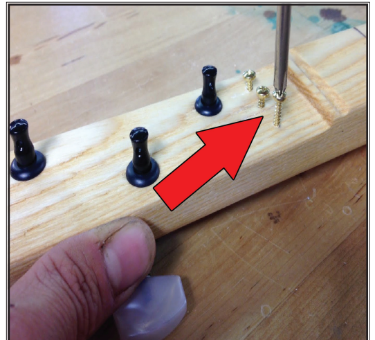
Suggested placement of the string retainer screws on the headstock.

String retainer screws. The string retainer screws should be placed near the bottom of the headstock recess (about 3/4" of an inch or so up from where the recess stops near the nut). They help keep the strings in place and at the right angle to keep them in place as they go over the nut. See the photo to the right for an idea of how we recommend they be mounted.