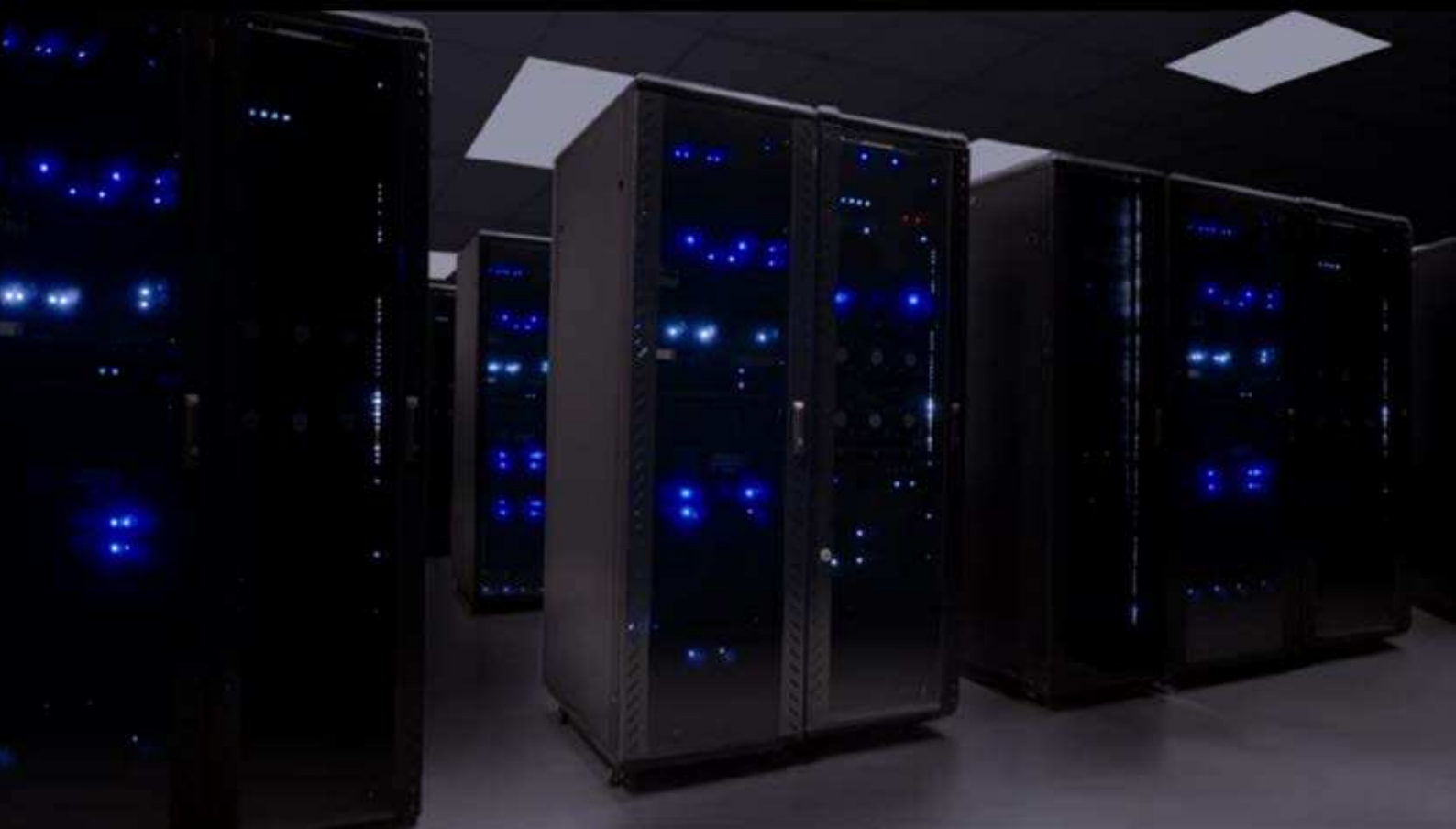
FIG 1 – Screen grabs of Lakeview Data Centre and server room ( Upload , 2020).